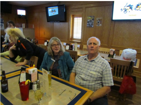
May Meeting