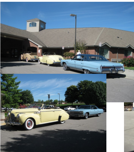
Abbey Park 2013